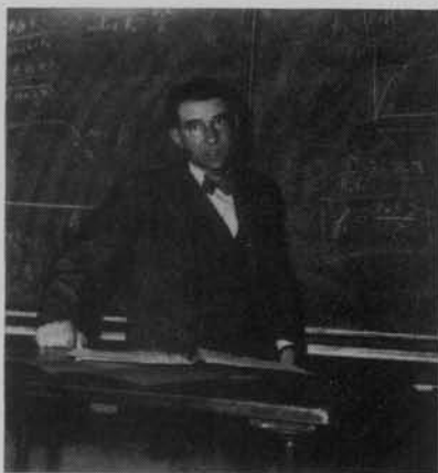
Fig. 1. Jacob Millman lecturing at City College of New York (1947–1948).

vacuum tubes. In the field of communications, radio circuits occupied the preeminent position, with the emphasis chiefly on sinusoidal waveshapes. What interest there existed in nonsinusoidal waveforms had to do mainly with rectifiers and filters. Saw-tooth time base generators were, of course, also known (they were already in use by 1936), but they apparently did not play a large role in the students' education. Even less of a role was played by pulse-type circuits. These were hardly known outside of a few scientific research laboratories.