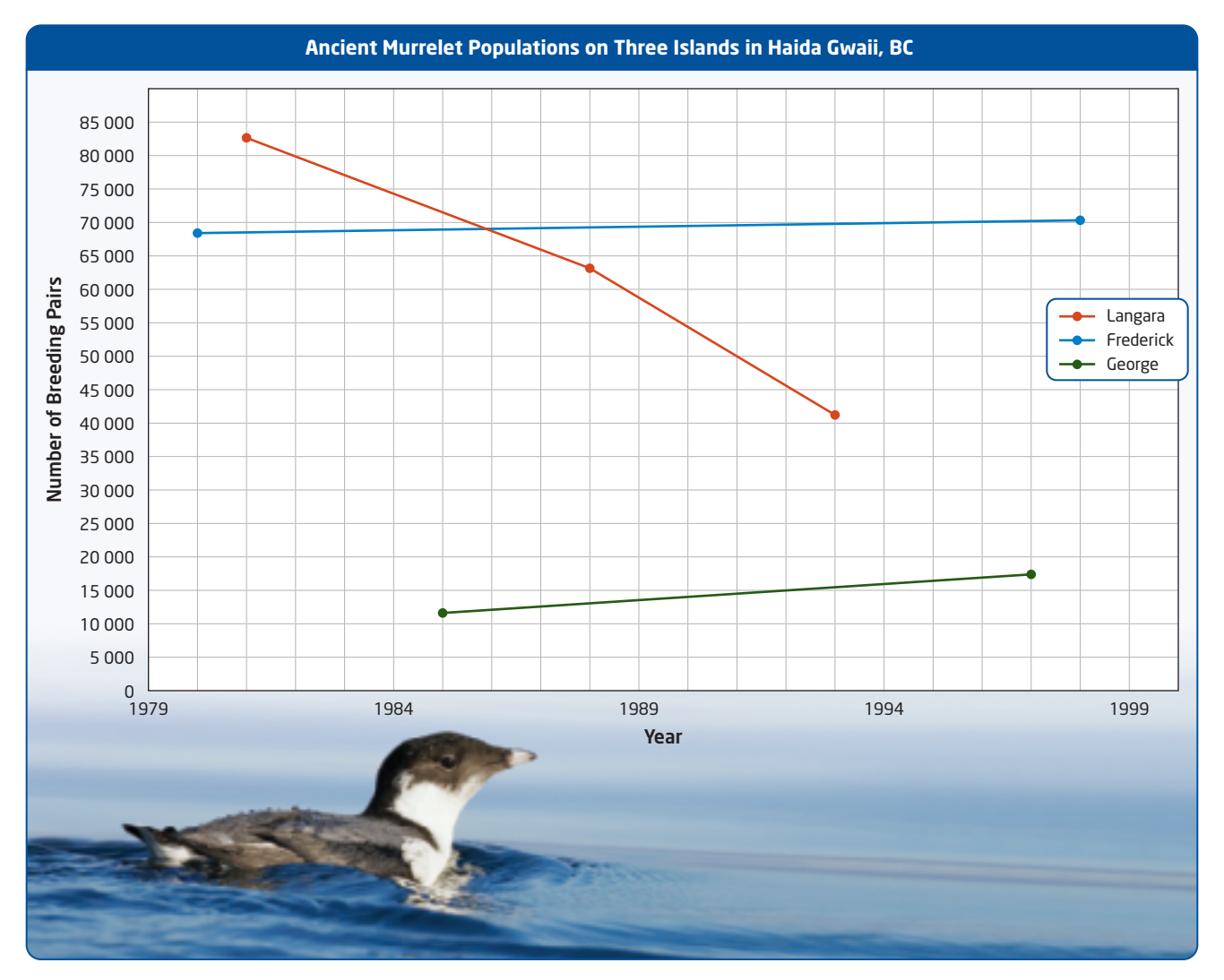
Figure 3.25 Following the accidental introduction of foreign rats around 1981, the colony of ancient murrelets on British Columbia's Langara Island dropped steadily. No rats were introduced to nearby Frederick Island or George Island.

Chemicals Sometimes, chemicals can be used carefully with success. Langara Island, off the coast of northern British Columbia, is home to countless nesting sea birds, including burrowing species. The island suits such birds because it was, originally, relatively predator-free. Then two alien species of rats, Norway rats and black rats, were accidentally introduced by ship. The rats ate birds' eggs and nestlings, causing the island's bird population to decline steadily. For example, the population of ancient murrelets, shown in Figure 3.25, was reduced by almost 40 000 individuals after the rats arrived on the island. Trapping failed to eliminate the rat population, but a poisoning campaign succeeded. Bait containing the poison was placed around the island for the rats. Although other animals, such as ravens and shrews, were also affected by the poison, the rats suffered a devastating population decline as a result of the poisoning campaign. By 1996, the rats had been eliminated from Langara Island. Since then, the population of ancient murrelets has rebounded.