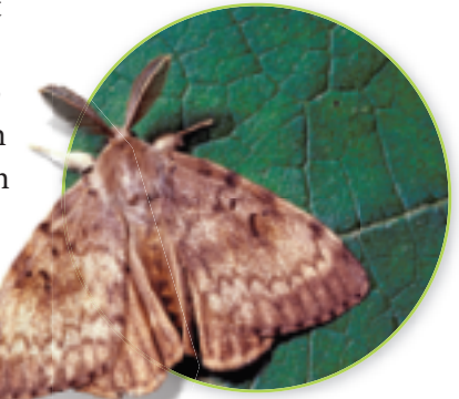
Figure 3.24 Gypsy moths can eat all the leaves on a tree.

biocontrol the use of a species to control the population growth or spread of an undesirable species