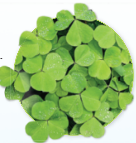
Figure 3.26 Clover is often planted to replenish nitrogen levels in soil.

Given population growth and the related widespread alteration of ecosystems, this century will require humans to restore and enhance sustainable ecosystems. Restoration ecology has developed tremendously, but many challenges remain, including the sometimes slow pace of recovery, the restoration of a different type of ecosystem than planned, the requirement of continuous intervention, and projects of very large scale, such as the Alberta Tar Sands, shown in Figure 3.27 . The extraction of petroleum from the Alberta Tar Sands involves almost total destruction of huge areas of boreal forest, as well as the production of tremendous volumes of tailings containing toxic waste. The scale of this project promises to be a major challenge for restoration.