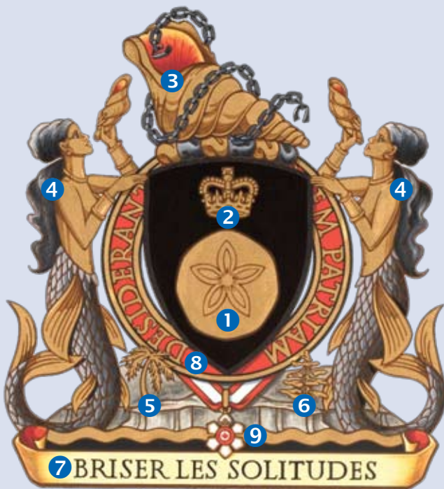
Governor General Michaëlle Jean's Personal Coat of Arms