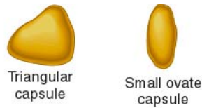
(a) Shepherd's purse capsule types

Answer: This result can be explained by a two-gene interaction in which each gene is found as a dominant or recessive allele. The presence of one dominant allele in either gene results in a triangular capsule. If we let T and t represent the dominant and recessive alleles of one gene and let V and v represent the dominant and recessive alleles of a second gene, the results of Shull's crosses are outlined in the following Punnett square: