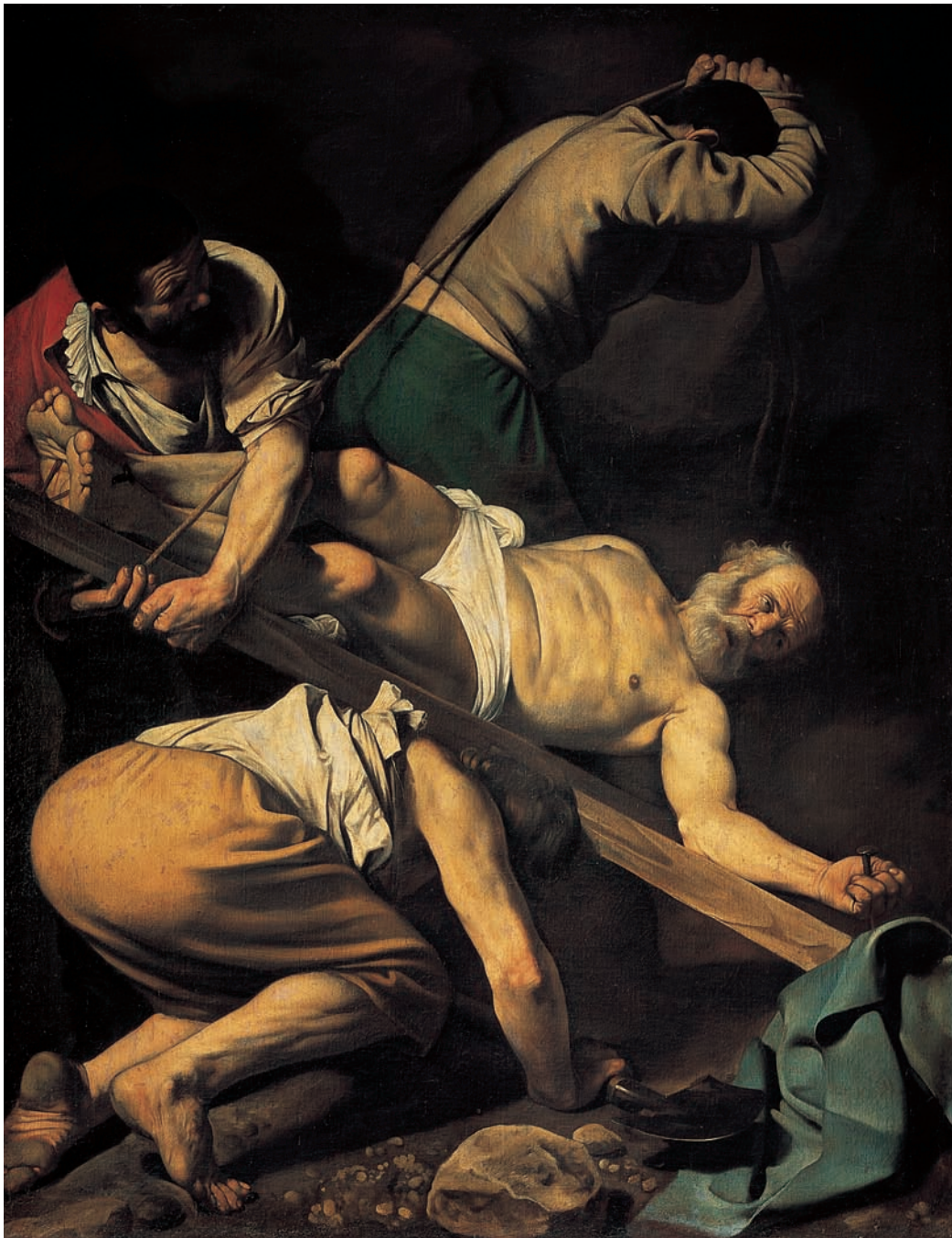
Figure 20.9 CARAVAGGIO , The Crucifixion of Saint Peter , 1601. Oil on canvas, 7 ft. 6 in. × 5 ft. 9 in. Santa Maria del Popolo, Rome.

to rise in astonishment. Unlike the visionary El Greco, Caravaggio brings sacred subjects down to earth with an almost cameralike naturalism. Where El Greco's saints and martyrs are ethereal, Caravaggio's are solid, substantive, and often quite ordinary. Their strong physical presence and frank homeliness transform biblical miracles into human narratives—a bold repudiation of Italian Renaissance conventions of beauty.