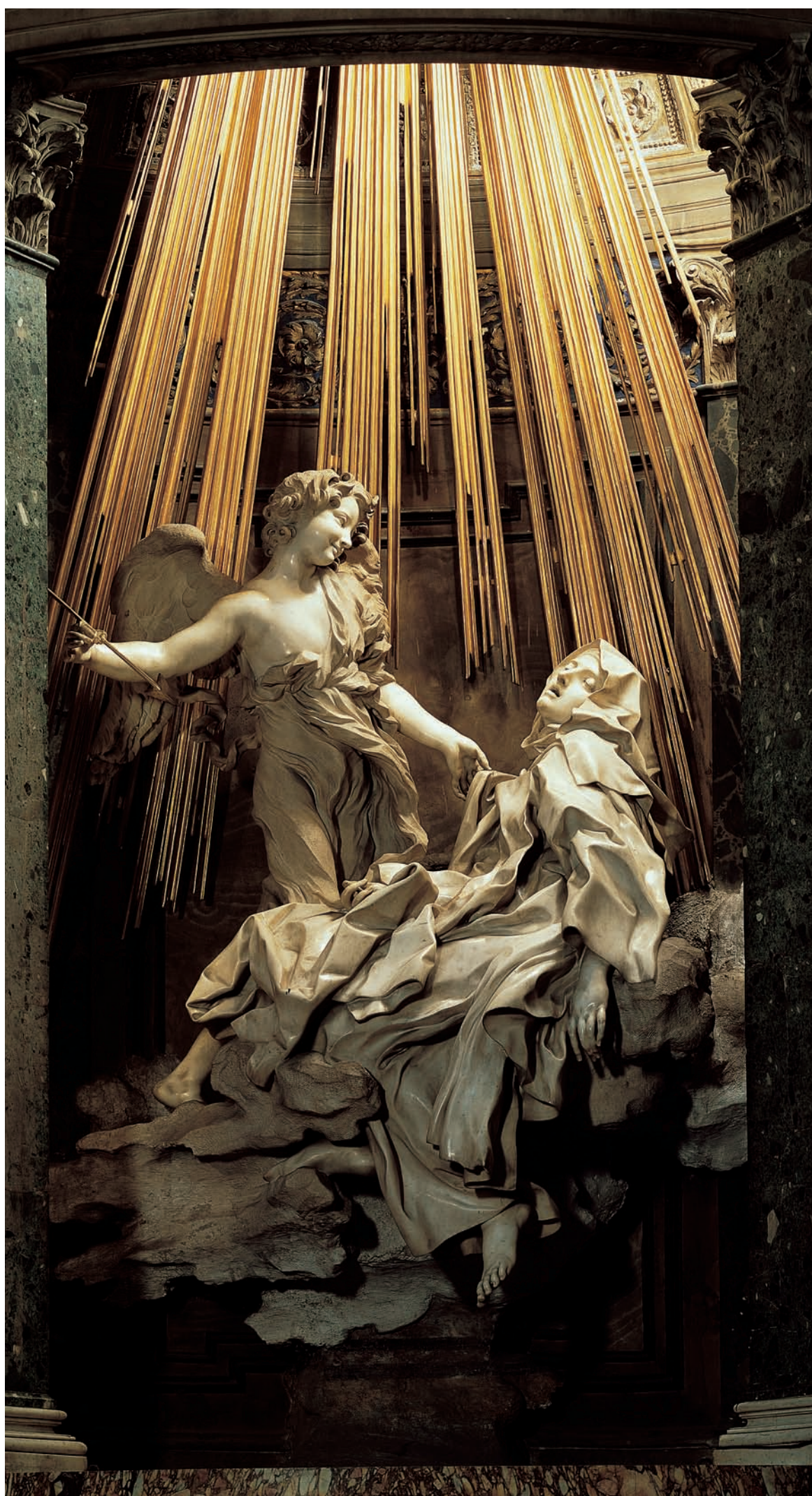
Figure 20.2 GIANLORENZO BERNINI , The Ecstasy of Saint Teresa , 1645–1652. Marble, height of group 11 ft. 6 in. Altar of Cornaro Chapel, Santa Maria della Vittoria, Rome.