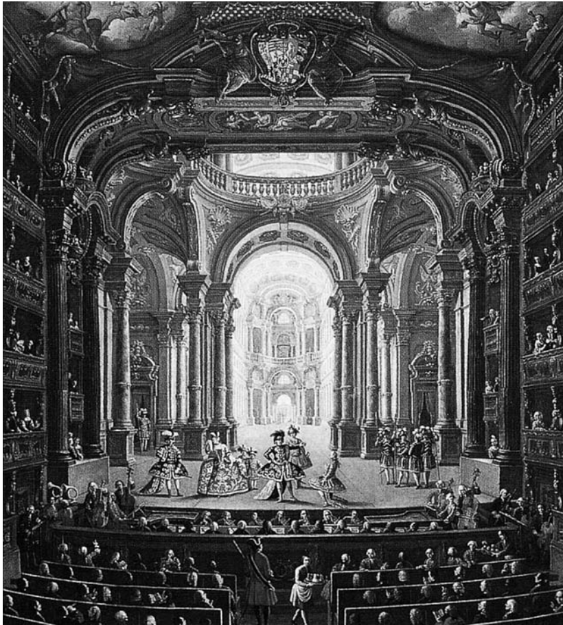
Figure 20.22 PIETRO DOMENICO OLIVIERI, The Teatro Regio, Turin , painting of the opening night, December 26, 1740. Oil on canvas, 4 ft. 2 \frac{1}{2} in. \times 3 ft. 8 \frac{1}{2} in. Five tiers of boxes are fitted into the sides of the proscenium, one even perched over the semicircular pediment. Note the orchestra, without a conductor; the girls distributing refreshments; and the armed guard protecting against disorder.

religious music, as well as ballets, madrigals, and operas. Like Gabrieli, Monteverdi discarded the intimate dimensions of Renaissance chamber music and cultivated an expansive, dramatic style, marked by vivid contrasts of texture and color. His compositions reflect a typically baroque effort to imbue music with a vocal expressiveness that reflected the emotional charge of poetry. “The [written] text,” declared Monteverdi, “should be the master of the music, not the servant.” Monteverdi linked “affections” or specific emotional states with appropriate sounds: anger, for instance, with the high voice register, moderation with the middle voice register, and humility with the low voice register. With Monteverdi, the union of music and speech sought in the word painting techniques of Josquin (see chapter 17) blossomed into full-blown opera: that form of theater that combined all aspects of baroque artistic expression—music, drama, dance, and the visual arts.