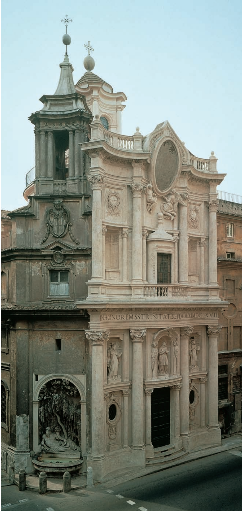
Figure 20.19 FRANCESCO BORROMINI, façade of San Carlo alle Quattro Fontane, Rome, 1667. Length 52 ft., width 34 ft., width of façade 38 ft.

The most daring of the Italian baroque architects was Francesco Borromini (1599–1667). Borromini designed the small monastic church of San Carlo alle Quattro Fontane (Saint Charles at the Four Fountains; Figure 20.19) to fit a narrow site at the intersection of two Roman streets. Rejecting the rules of