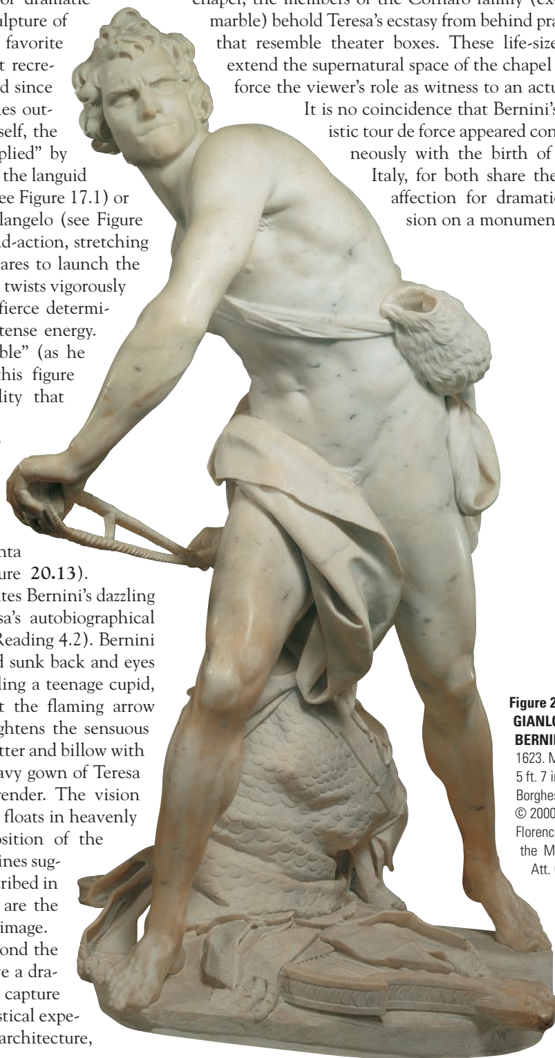
Figure 20.12 GIANLORENZO BERNINI, David , 1623. Marble, 5 ft. 7 in. Galleria Borghese, Rome.

It is no coincidence that Bernini's illusionistic tour de force appeared contemporaneously with the birth of opera in Italy, for both share the baroque affection for dramatic expression on a monumental scale.