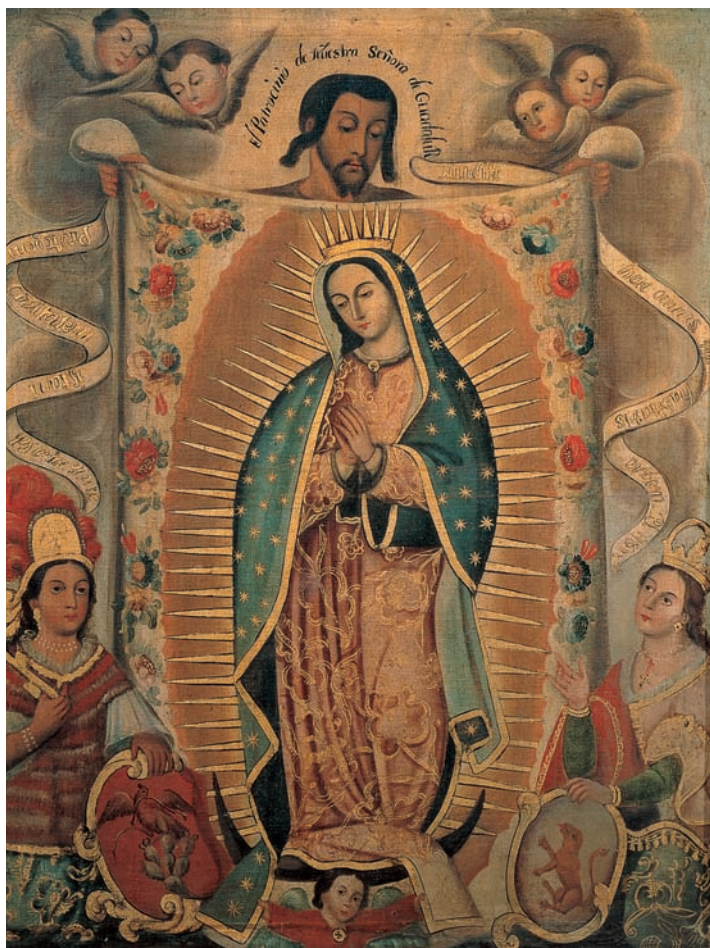
Figure 20.1 The Virgin of Guadalupe , 1746. Oil on wood. National Palace, Mexico City

The country expelled almost all Western foreigners from Japanese soil by 1624, after a wave of brutal persecutions of both European Christians and Japanese converts to Catholicism.