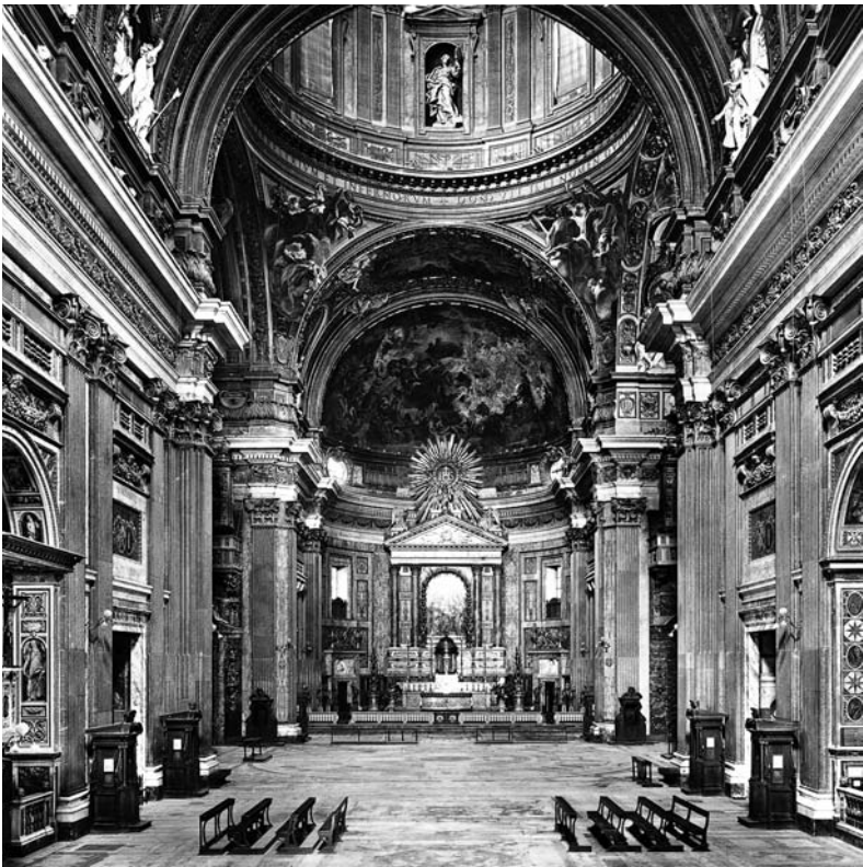
Figure 20.16 GIACOMO DA VIGNOLA , interior of Il Gesù, Rome, 1568–1573. Length approx. 240 ft.