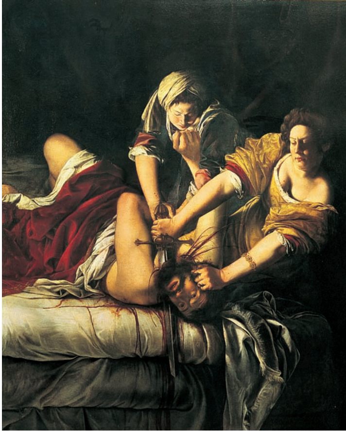
Figure 20.10 ARTEMISIA GENTILESCHI, Judith Slaying Holofernes , ca. 1614–1620. Oil on canvas, 6 ft. 6½ in. × 5 ft. 4 in. Uffizi Gallery, Florence.

still life (see chapter 23). Gentileschi's paintings, however, challenged tradition. Her powerful rendering of Judith slaying Holofernes (Figure 20.10), which compares in size and impact with Caravaggio's Crucifixion of Saint Peter (see Figure 20.9), illustrates the decapitation of an Assyrian general and enemy of Israel at the hands of a clever Hebrew widow. A tale found in the Apocrypha (the noncanonical books of the Bible), the slaying of the tyrannical Holofernes was a favorite Renaissance allegory of liberty and religious defiance. Gentileschi brought to this representation the dramatic techniques of Caravaggio: realistically conceived figures, stark contrasts of light and dark, and a composition that brings the viewer painfully close to the event. She invested her subject with fierce intensity—the foreshortened body of the victim and the pinwheel arrangement of human limbs forces the eye to focus on the gruesome action of the swordblade as it severs head from neck in a shower of blood.