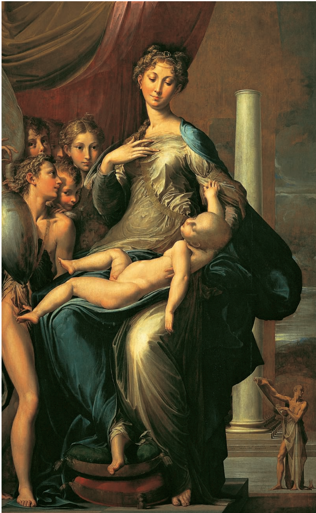
Figure 20.4 PARMIGIANINO , Madonna of the Long Neck , 1534–1540. Oil on panel, 7 ft. 1 in. × 4 ft. 4 in. Uffizi Gallery, Florence.

Roman Empire had sacked the city of Rome, Michelangelo returned to the chapel whose ceiling he had painted some twenty years earlier with the optimistic vision of salvation. Now, in a mood of brooding pessimism, he filled the altar wall with agonized, writhing figures that press dramatically against one another. Surrounding the wrathful Christ are the Christian martyrs, who carry the instruments of their torture, and throngs of the resurrected—originally depicted nude but later, in the wake of Catholic reform, draped to