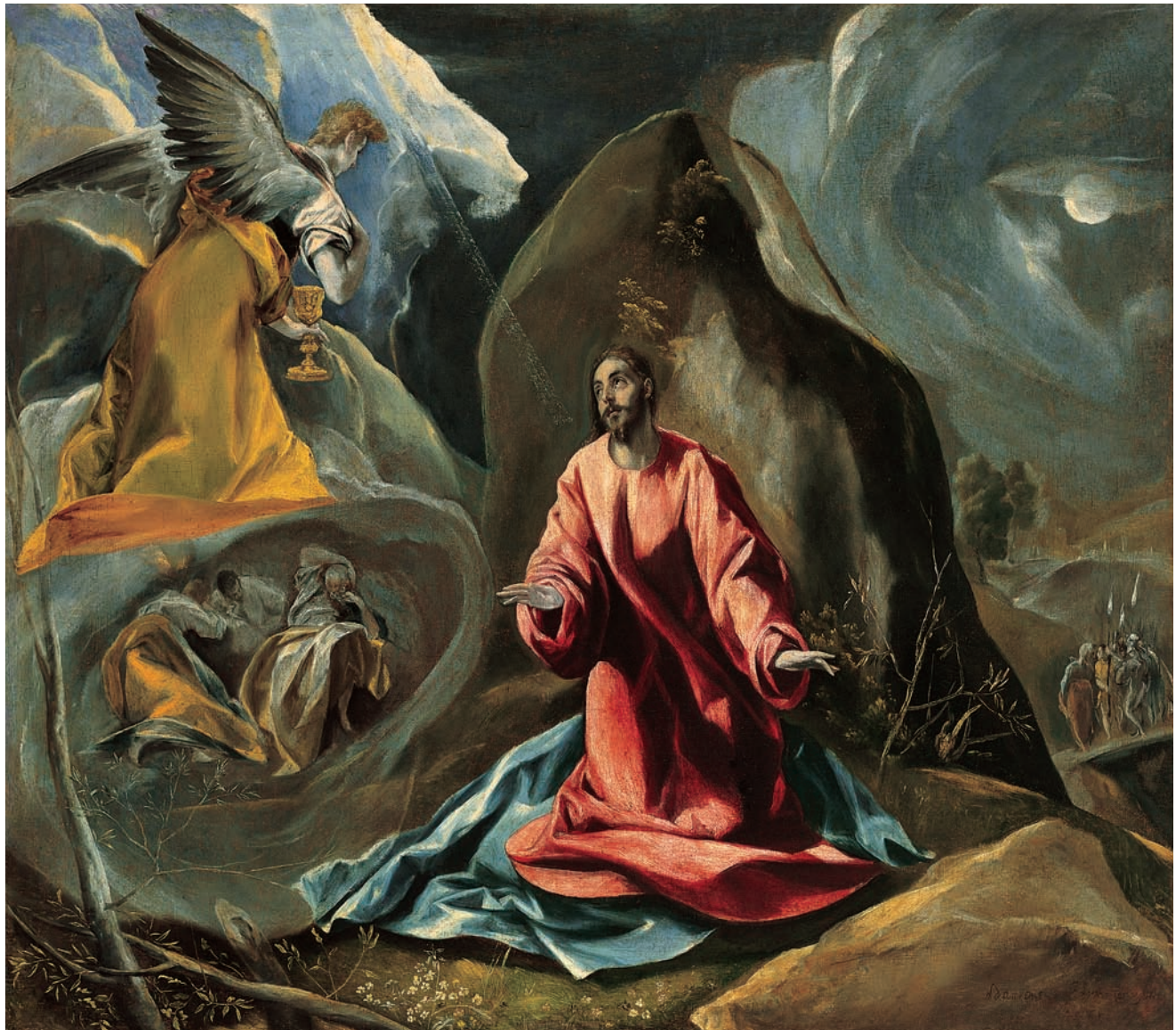
Figure 20.7 EL GRECO , The Agony in the Garden , ca. 1585–1586. Oil on canvas, 6 ft. 1 in. × 9 ft. 1 in. Purchased with funds from the Libbey Endowment, Gift of Edward Drummond Libbey.

origins) as El Greco (1541–1614). A master painter who worked in Italy and Spain in the service of the Church and the devout Philip II (1527–1598), El Greco preferred the expressive grace of Tintoretto to the more muscular vitality of Michelangelo. With the inward eye of a mystic, he produced visionary canvases marked by bold distortions of form, dissonant colors, and a daring handling of space. His elongated and flamelike figures, often highlighted by ghostly whites and yellow-grays, seem to radiate halos of light—auras that symbolize the luminous power of divine revelation. In The Agony in the Garden , the moment of Jesus' final submission to the divine will, El Greco created a moonlit landscape in which clouds, rocks, and fabrics billow and swell with mysterious energy (Figure 20.7). Below the tempestuous sky, Judas (the small pointing figure on the lower right) leads the arresting officers to the Garden of Gethsemane. The sleeping apostles, tucked away in a cocoonlike envelope, violate rational space: they are too small in relation to the oversized image of Jesus and