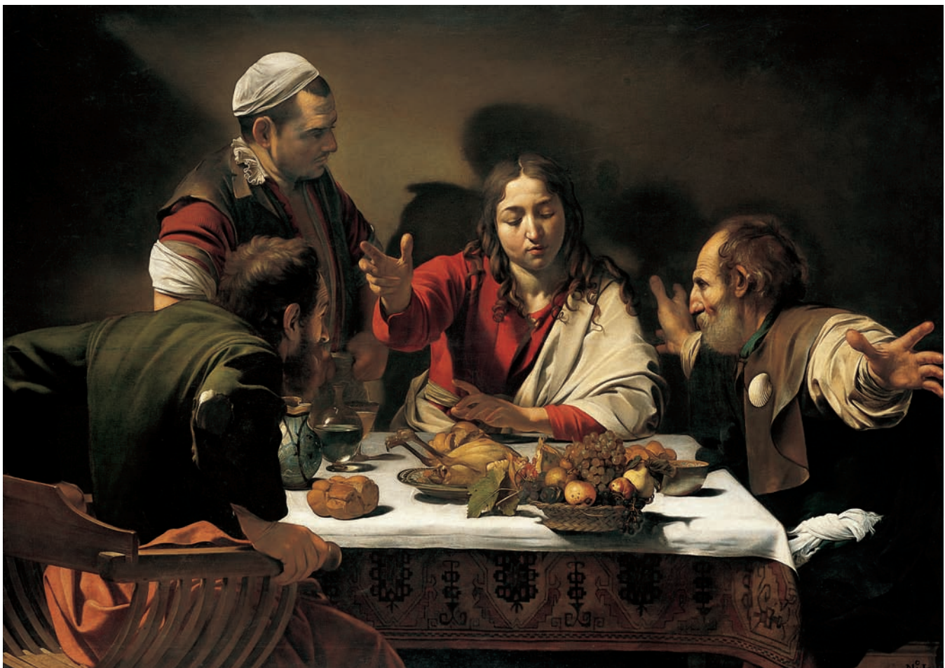
Figure 20.8 CARAVAGGIO, The Supper at Emmaus , ca. 1600. Oil on canvas, 4 ft. 7 in. × 6 ft. 5½ in. National Gallery, London.