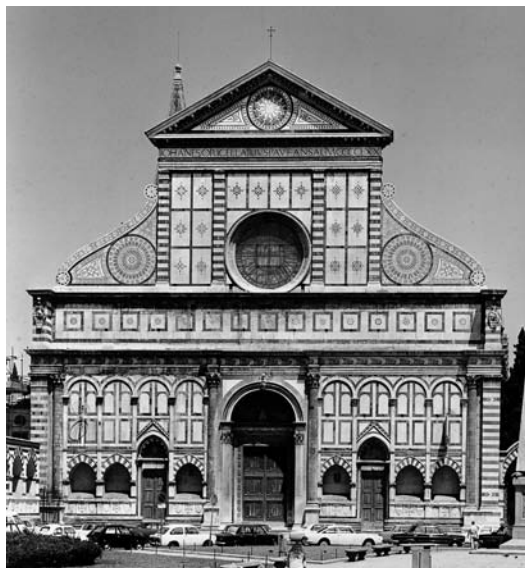
Figure 20.18 LEON BATTISTA ALBERTI , (below) façade of Santa Maria Novella, Florence, completed 1470. Width approx. 117 ft.