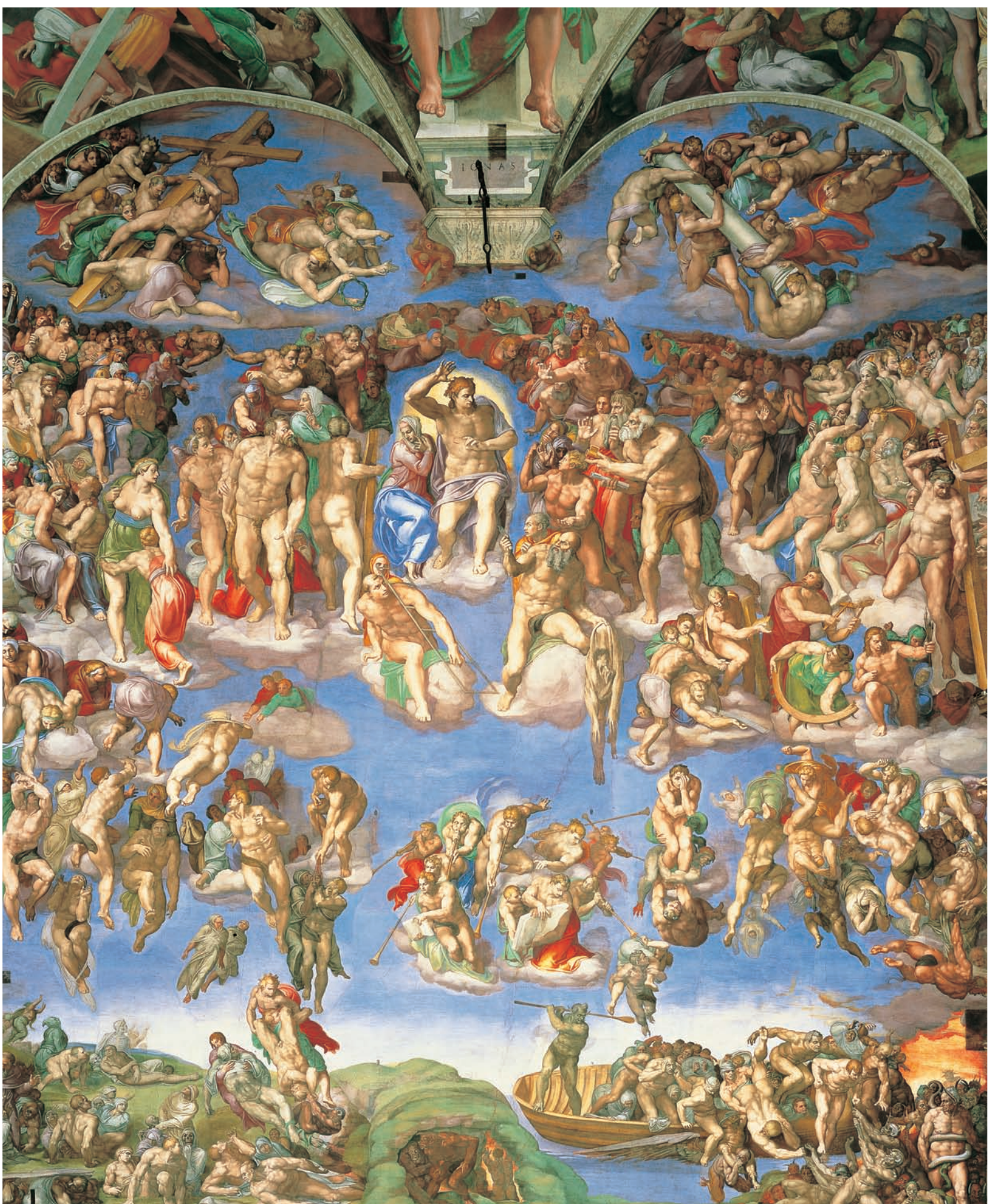
Figure 20.3 MICHELANGELO BUONARROTI, The Last Judgment (after restoration), 1536–1540. Fresco, 48 × 44 ft. Altar wall, Sistine Chapel, Vatican Museums, Rome.