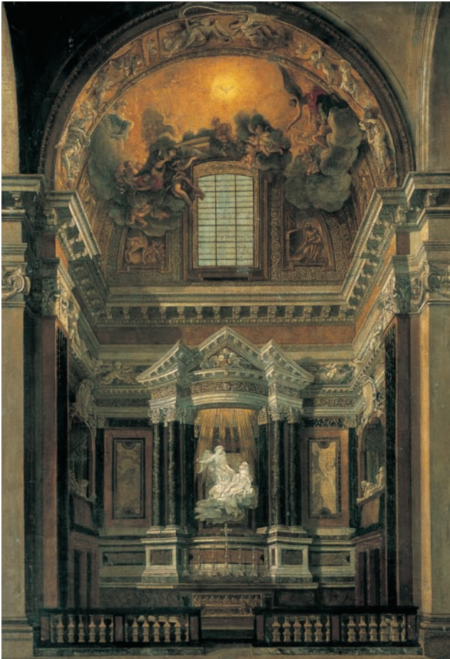
Figure 20.13 Anonymous, Cornaro Chapel, ca. 1644. Oil on canvas, 5 ft. 6¼ in. × 3 ft. 11¼ in. Staatliches Museum, Schwerin, Germany.