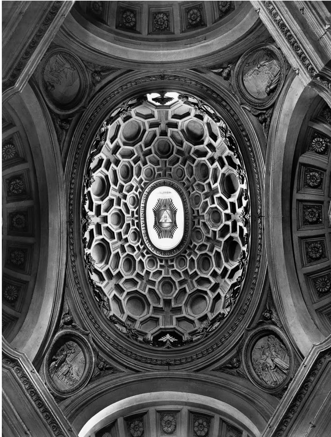
Figure 20.20 FRANCESCO BORROMINI , interior of dome, San Carlo alle Quattro Fontane, Rome, ca. 1638. Width approx. 52 ft.

classical design, he combined convex and concave units to produce a sense of fluid, undulating movement. The façade consists of an assortment of deeply cut decorative elements: monumental Corinthian columns, a scrolled gable over the doorway, and life-sized angels that support a cartouche at the roofline. Borromini's aversion to the circle and the square—the “perfect” shapes of Renaissance architecture—extends to the interior of San Carlo, which is oval in plan. The dome, also oval, is lit by hidden windows that allow light to flood the interior. Carved with geometric motifs that diminish in size toward the apex, the shallow cupola appears to recede deep into space (Figure 20.20). Such inventive illusionism, accented by dynamic