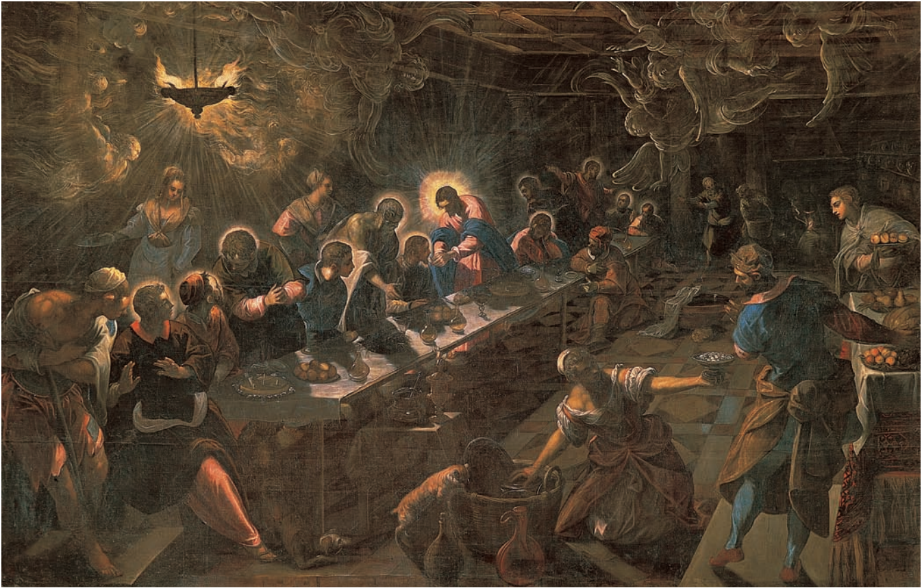
Figure 20.5 JACOPO TINTORETTO , The Last Supper , 1592–1594. Oil on canvas, 12 ft. × 18 ft. 8 in. San Giorgio Maggiore, Venice.

precariouly above a courtyard adorned with a column that supports no superstructure, the unnaturally elongated Mother of God—her spidery fingers affectedly touching her chest—gazes at the oversized Christ child, who seems to slip lifelessly off her lap. Onlookers crowd into the space from the left, while a small figure (perhaps a prophet) at the bottom right corner of the canvas draws our eye into distant space. Cool coloring and an overall smoky hue make the painting seem even more contrived and artificial, yet, by its very contrivance, unforgettable.