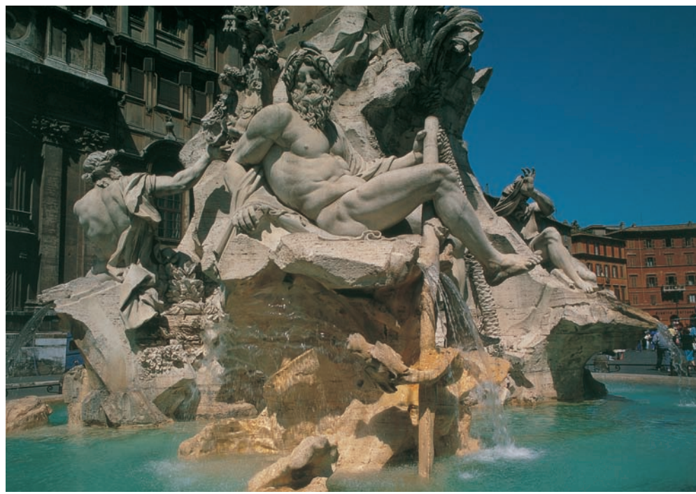
Figure 20.11 GIANLORENZO BERNINI, Fountain of the Four Rivers, 1648–1651. Travertine and marble. Piazza Navona, Rome.

Gianlorenzo Bernini (1598–1680), Caravaggio's contemporary, brought the theatrical spirit of baroque painting to Italian architecture and sculpture. A man of remarkable technical virtuosity, Bernini was the chief architect of