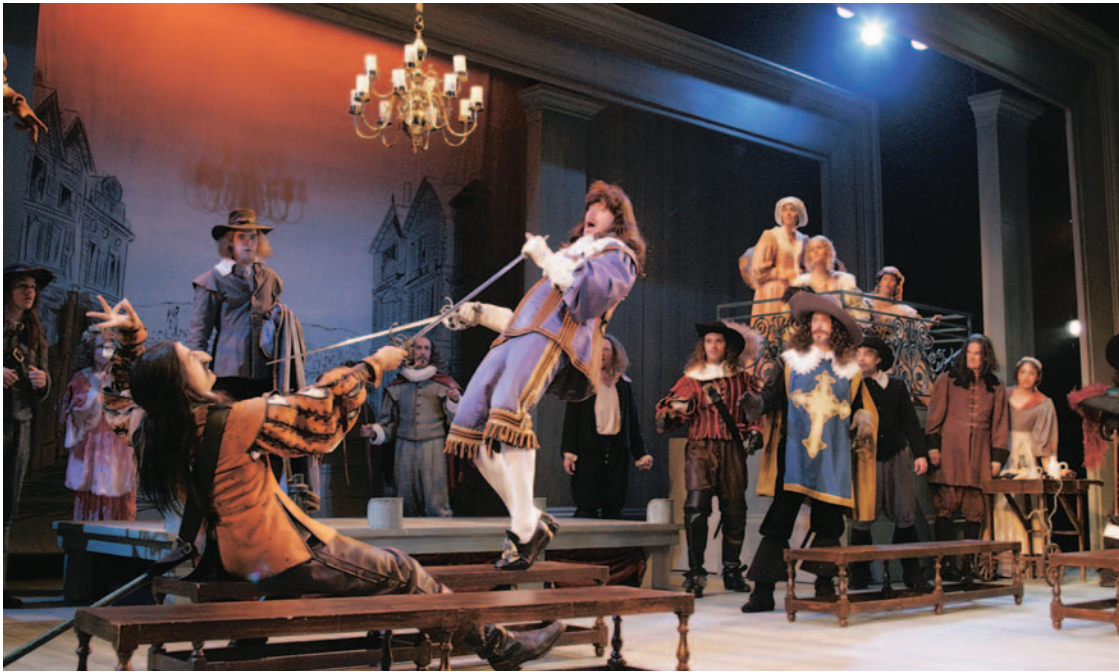
The romantic spirit encompasses more than romance; it is also swashbuckling swordplay, picaresque characters, poetic elaborations, and period costumes – all of which come together in the famous dueling-rhyming scene between the long-nosed Gascon poet-soldier Cyrano and his aristocratic rival, the Comte de Guiche, in Edmond Rostand's Cyrano de Bergerac (1898), produced here by South Coast Repertory in 2004.

and eliminate onstage depictions of physical violence. Indoor theatres, lit by candles instead of sunlight, replaced the outdoor public theatres of earlier times, providing more intimate and comfortable surroundings for an increasingly well-dressed audience. Furthermore, protection from wind and weather permitted elaborately painted scenery and stage machinery. Several of these theatres are architectural gems that have remained in continuous use to the present day. Style, wit, grace, and class distinction became not merely the framework of drama but its chief subject, and the fan and the snuffbox became signature props. This was also the Western world's first era of extensive theatrical commentary and thus the first from which we have detailed commentaries and evidence—both textual and visual—of the era's