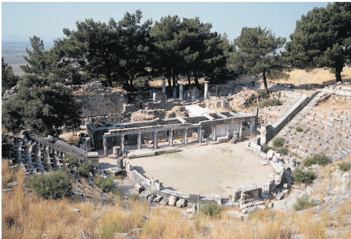
The Greek theatre of Priene, in modern-day Turkey, dates from about 300 B.C. Unlike most Greek theatres, Priene was never rebuilt by the Romans and thus remains one of the best examples of a hillside Greek theatron . The standing row of columns and connecting lintel once made up the front of the stone skene , or stagehouse.

Greek tragedies explored the social, psychological, and religious meanings of the ancient gods and heroes of Greek history and myth, as well as current events; the comedies presented contemporary issues affecting all Athenians. Both types of drama were first staged in a simple wheat-threshing circle on the ground (the orchestra ), with a dressing hut ( skene ) behind it; the audience was seated on an adjacent hillside (the theatron ). As Greek culture expanded, however, huge amphitheaters—the largest of which sat upward of 15,000 people—were built in Athens and subsequently throughout the grow-