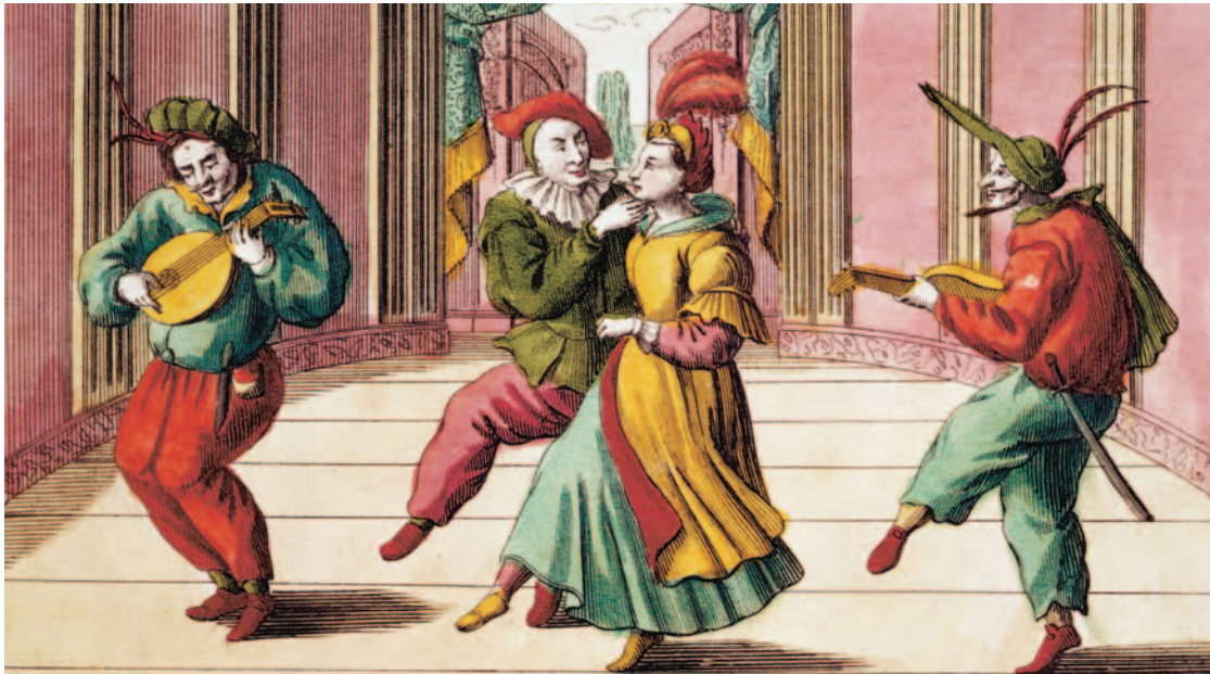
An eighteenth-century illustration of Italian commedia dell'arte .

PYRAMUS: Sween moon, I thank thee for thy sunny beams. I thank thee, moon, for shining now so bright; For by thy gracious, golden, glittering gleams, I trust to take of truest Thisbe sight. But stay, O spite! But mark, poor knight, What dreadful dole is here! Eyes, do you see? How can it be? O dainty duck! O dear!