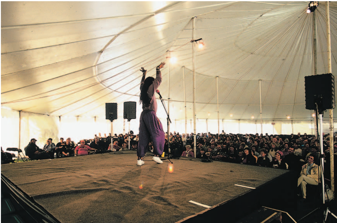
Storytelling, an art more ancient than theatre, is still practiced as a public performance form, nowhere more successfully than at the annual Jonesborough, Tennessee, storytelling festival.

fore a single point of view. And while rituals may attract an audience, storytelling requires an audience: “hearer-spectators” who either don’t know the story being told or are eager to hear it again with new details or fresh expression. Storytelling thus generates elements of character impersonation—the creation of voices, gestures, and facial expressions that reflect the personalities of the individuals portrayed—and seeks means to convey character emotions to the hearer-spectators. It also seeks to entertain, and thus it provides a structured story —rather than a random series of observations—which makes the narrative flow so as to compel audience engagement through suspense, varied graphic details, and a calculated momentum of escalating events that, in theatre, will be called a plot . We can see all of these