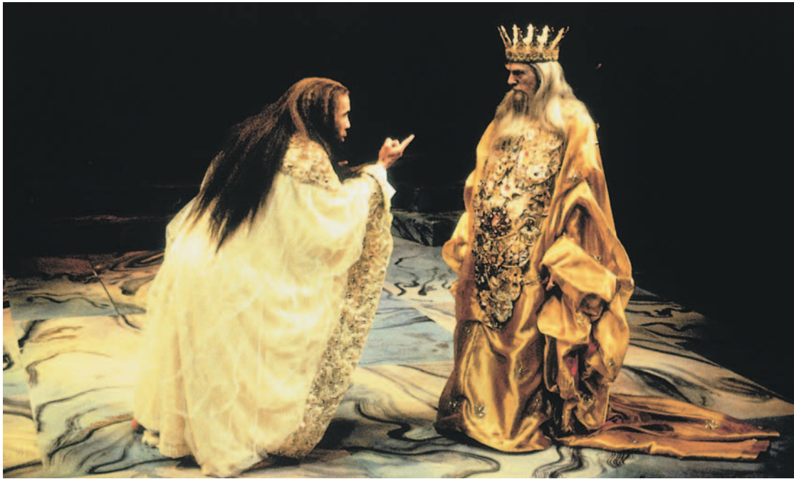
Priest and playwright Pedro Calderón de la Barca (1600–1681) was Spain's great court dramatist, whose philosophical and theological plays were deemed more elegant and refined than those of his Renaissance predecessors Lope de Vega and Miguel Cervantes. Calderón's masterpiece, Life Is a Dream (c. 1638), treats moral responsibility in a royal (courtly) context; this scene is from the Denver Theatre Center's 1998 production, staged as part of a summer festival of Spanish golden-age drama.

pageantry, and humor, which only performance brings to life. They are both great dramatic art and magnificent theatrical entertainment.