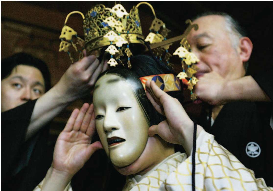
Nō actors usually come from long-standing nō families that operate nō schools. Here one of Japan's "living national treasures," the venerable Otoshige Sakai of the Kanze Nō-gakudo school, which was founded in the fourteenth century, helps mask his son, Otaharu, before a 2004 performance in Tokyo.

is reminiscent of the time when the stage was housed in a separate building, which the audience observed from a distance; the nō roof is supported by four wooden pillars, each with its own name and historic dramatic function. A wooden "mirror wall" at the rear of the stage bounces back the sounds of music and singing to the audience; on the wall, a painted pine tree, delicately gnarled and highly stylized, provides the only scenery. A four-man orchestra—whose instruments include a flute, small and large hand drums, and a stick drum—provides continuous musical accompaniment at the rear of the stage, and a chorus of six to ten singer-chanters is positioned on a platform addition at stage left. The absolute precision of