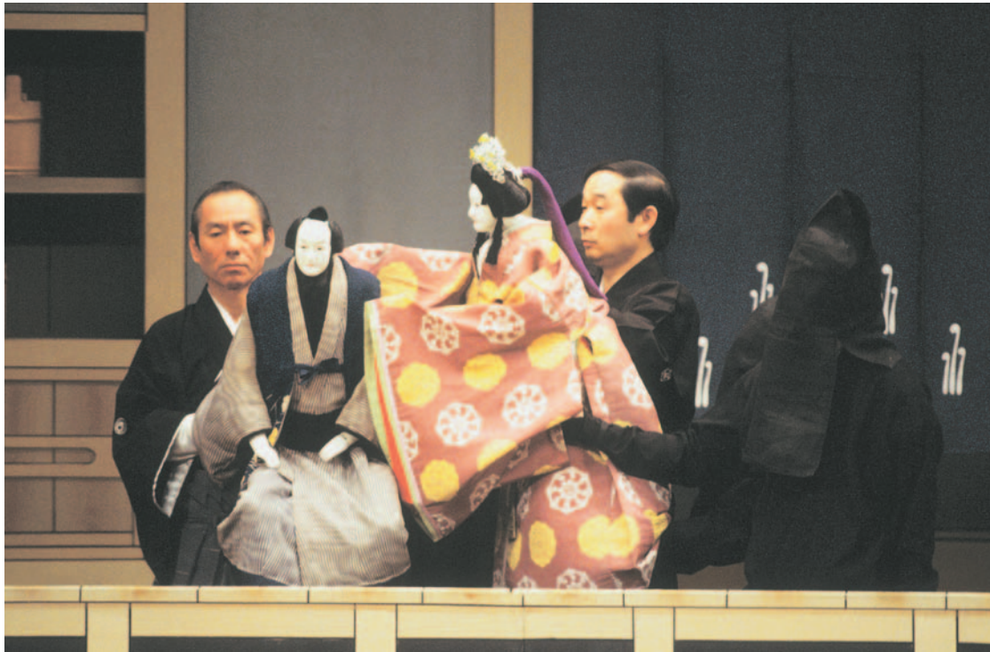
This bunraku performance of Yoshitsune and the Thousand Cherry Trees was performed at the National Theatre of Osaka, Japan.

the plays of the Royal and romantic eras as well), by a continuous tradition of performance. All of these traditions have influenced the modern theatre, as we will see in the next chapter. Increasingly, that influence crosses