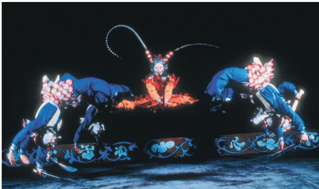
Circus-style acrobatics have always been a great feature of the stylized battle scenes in Chinese xiqu , as shown here by the brilliant leaps and flips of the wu sheng (acrobat warrior) performers of China's Hebei Opera Company during their 1998 international tour.

By the end of the Ming dynasty, in 1644, zaju had been succeeded by a more stately, poetic, and aristocratic opera known as kunqu , originating from the town of Kunshan; soon thereafter kunqu became the favored theatre entertainment of the Chinese court. Kunqu is still performed today. More popular theatre developed around the same time in the form of a more boisterous “clapper opera,” characterized by the furious rhythmic beating of drumsticks on a hardwood block. And in subsequent years, many regional theatre styles, influenced by the zaju , kunqu , and clapper opera forms, arose throughout the country. Today there are as many as 360 variations of Chinese Opera in the People's Republic, most of them—such as Cantonese Opera, Sichuan Opera, Hui Opera—known by their regional origins.