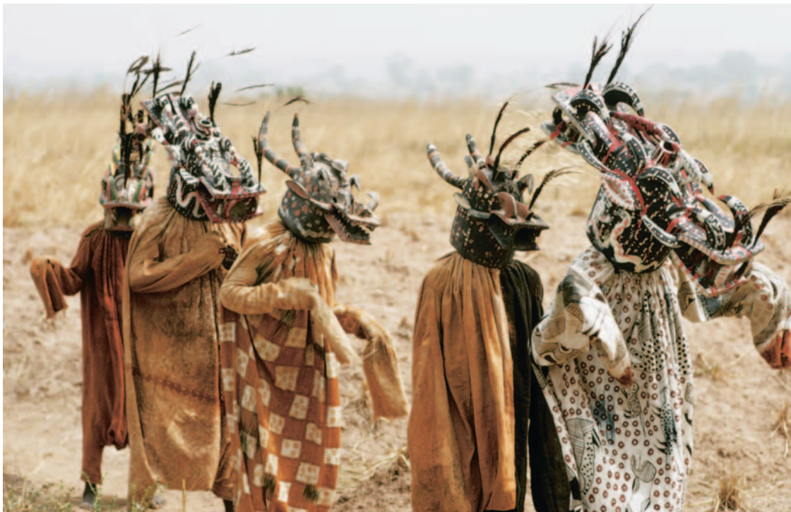
The antiwitchcraft kponiugo mask of the Poro secret society of the Senufo tribe in West Africa's Ivory Coast is believed to protect the community from sorcerers and soul-stealers. Groups of Poro maskers seem to spit fire between the alligator teeth of their open jaws. Wild boar tusks and antelope horns represent ferocity and gentleness.

While theatrical performances almost certainly began in sub-Saharan Africa, they soon drifted northward, up the Nile River to what we now know as Egypt. From there they spread to Mesopotamia, Canaan, and eventually throughout