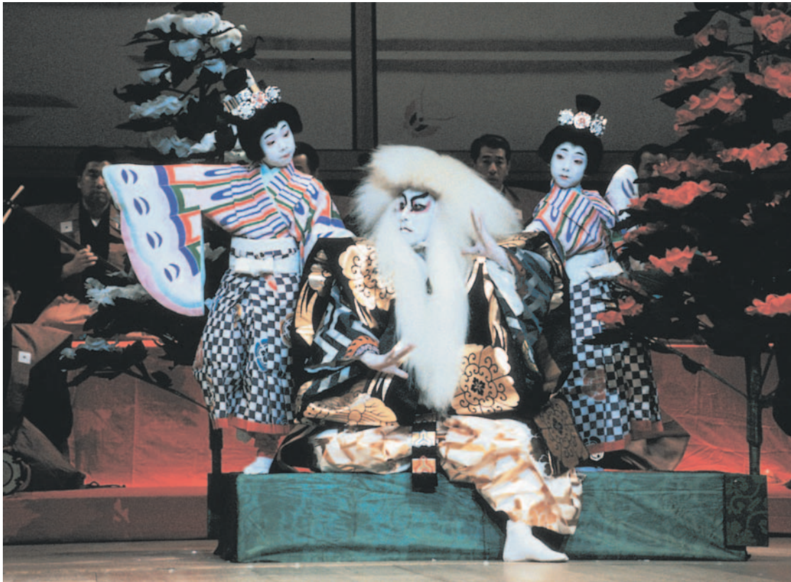
In kabuki's famous dance-drama Kagami Jishi (The Lion Dance), the lion (played by Nakamura Kankuro V) is teased by butterflies (played by his sons Nakamura Kantaro II and Nakamuro Schichinosuki II).

culture—between affairs of the heart and the call of duty. A great many domestic plays end in suicide (many, in fact, end in double suicides), with the lovers vowing to meet again in the world to come; such plays have been the subject of attempted bannings, as they have led to real suicides in consequence.