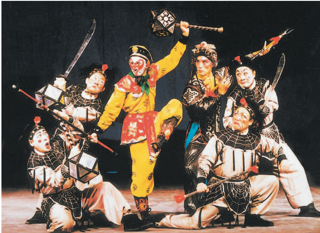
The Monkey King – a ferocious scamp – is the most enduring character in xiqu; he is always dressed in yellow, as shown here in this Shanghai Jingju Theatre production of Pansi Cave .

by the Chinese Cultural Revolution in the 1960s and 1970s—a highly popular national entertainment in China and around the world.