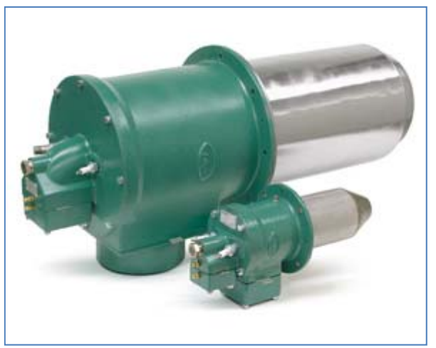
Figure 1 Eclipse burner

In 2006, Eclipse launched a project to get this problem under control using a data management system. This process has taken four years and is still a work in progress. This case study explores their journey, the benefits achieved, and evolving world of product data management. By studying Eclipse, it becomes clear why companies that make products sharing common parts, or companies that have multiple manufacturing facilities, need a Product Data Management (PDM) or a Product Lifecycle Management (PLM) system. Further, the case study will show how Bills