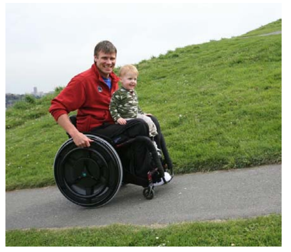
Figure 1 A wheelchair with MAGICWheels going up a hill

MAGIC WHEELS® tackled this problem and developed a 2-speed, patented system that has met with wide acceptance. During the development, there were several times when the