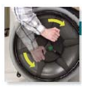
Figure 5: The shifting

During the development of this system, once committed to the hypocycloid, progress got stuck in that it did not shift well enough to bring to market. It was necessary to move the hand rim while moving the shifting lever back & forth to get the gears to mesh. This motion required two hands violating an important design requirement. They worked on this problem for six months. As a funding deadline approached they knew they had to resolve the issues. They tried many things, each helped a little. For example, they changed the shape of the gear teeth to allow them to not only engage and disengage more easily, but to make shifting so that the new gearing is made before the old one action needed is release to maximize safety. As time was running out,