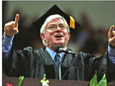
CUTLINE: Phil Donahue speaks at graduation.

Sure, every picture tells a story. But it's the cutline's job to tell the story behind every picture: who's involved, what's happening, when and where the event took place. A well-written cutline makes the photo instantly understandable and tells readers why the photo — and the story — are important.