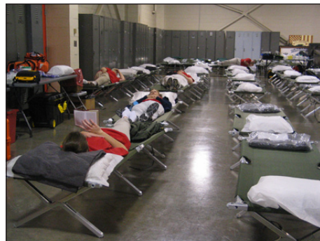
CUTLINE: Medics and nurses await patients after Hurricane Katrina.

Require that your photographers store their cutline information in the Description field located under File/File info in Adobe Photoshop and in the metadata boxes in programs such as Adobe Lightroom or Apple Aperture.