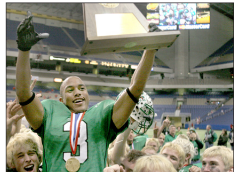
CUTLINE: Player celebrates winning state championship.