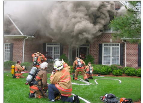
CUTLINE: House on fire.