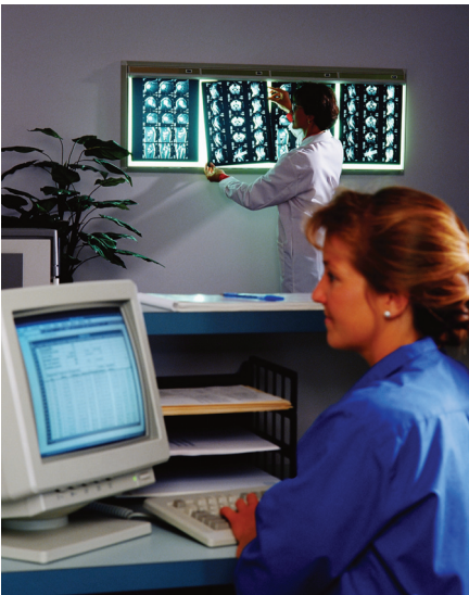
FIGURE 1-1 Medical procedures are documented electronically as in this hospital or on paper as in many medical offices. Sometimes, both types of documentation are used.

Formats for records depend on state law, the institution's responsibilities, the configuration of its computer systems, and its coding and billing practices. One plan of organization is the SOAP approach. SOAP stands for subjective , objective , assessment , and plan . When first dealing with a patient, the health care practitioner receives the subjective information from the patient (how the patient feels, what the symptoms are). Next, the health care practitioner performs an examination (takes temperature, blood pressure, pulse) and orders tests (blood and urine tests, allergy tests), thereby getting the objective facts needed for a diagnosis. The assessment stage is the examination of all data and the reaching of a conclusion (the diagnosis). Finally, a plan—treatments, medications, tests, and patient education—is determined and put into action for ongoing evaluation. Figure 1-1 is an