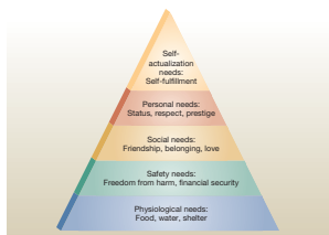
FIGURE 8-5 Hierarchy of needs