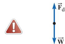
Figure 4.35 FBD for an object falling at its terminal velocity.