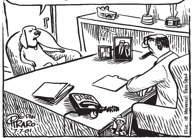
Source: BIZARRO © 2001 by Dan Piraro. Reprinted with permission of Universal Press Syndicate. All rights reserved.

I'm tired of these happy ending" Disney films, Morrie. I want a role I can sink my teeth into. Something meaty. C'mon Morrie, throw me a bone here. Or am I barking up the wrong tree?