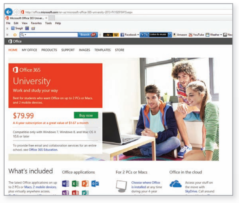
C-11 Office 365 University purchase site

To install Office 2013, you need to first purchase Office 2013. (See the comments earlier in this appendix about purchasing Windows 8; many times you will be given the best academic pricing through the computer services department.) You can also purchase Office 365 University (Office 2013) from: http://office.microsoft.com/en-us/microsoft-office-365university-2013-FX102918415.aspx (Figure C-11). Be sure to choose the appropriate Windows version when you purchase. Once you have the installation DVD, follow the steps in the following How To section to install the latest version of Windows Office applications.