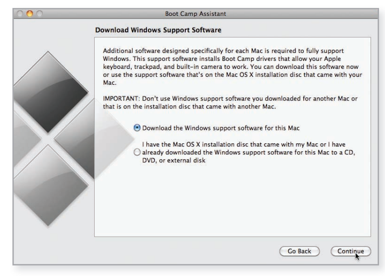
C-5 Download Windows Support Software screen