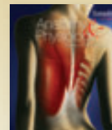
The story continues (2009)