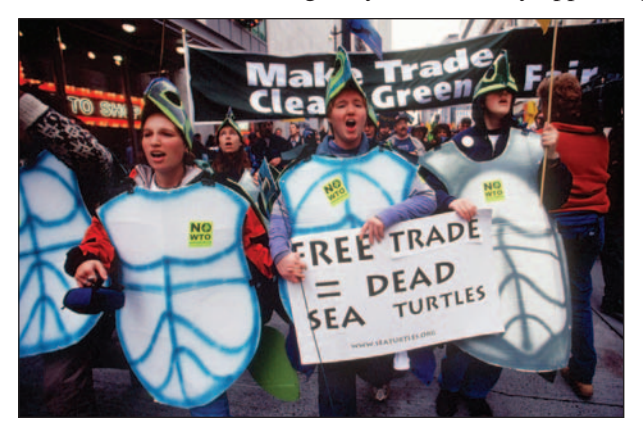
Protesters carry a banner linking free trade practices and sea turtle survival during the WTO meeting in Seattle in 1999. All seven species of sea turtles are currently endangered.

Recently the merits of globalization have been the subject of many heated debates. When the World Trade Organization met in Seattle in 1999, there were extensive public protests about globalization and the liberalization of international trade. Further antiglobalization protests occurred when the WTO met in Davos, Switzerland, in early 2001, and at other gatherings of international organizations and leaders since that time. The debate is, in many respects, waged by diametrically opposed groups with extremely different views regarding the conse-