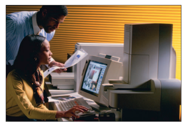
The Internet and network computing enable small companies to compete globally because they make possible the rapid flow of information regardless of the physical location of the buyer and seller.

The ease of obtaining information and making transactions on the Internet has started to have a profound effect on many firms and especially on business-to-business commerce. Whereas companies formerly used faxes, telephones, or regular mail to complete their transactions, they now use the chapter and faster Internet. The emergen