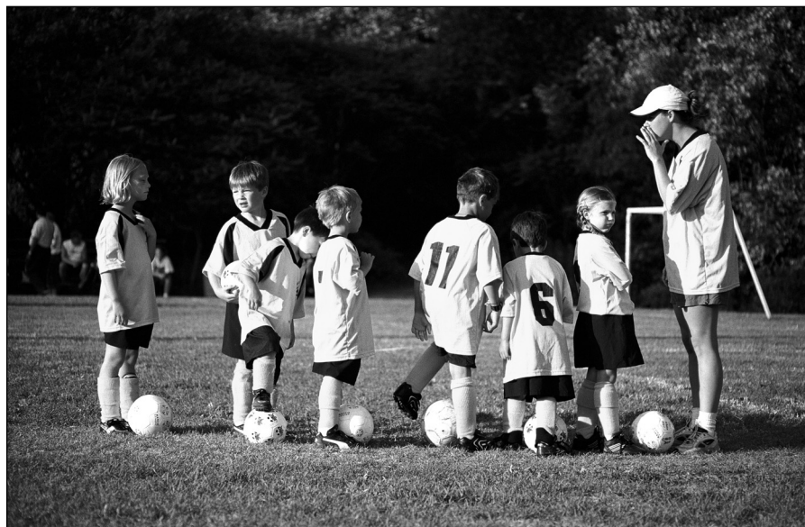
During the juvenile stage, children need to learn competition, cooperation, and compromise.

During the juvenile stage, Sullivan believed, a child should learn to compete, compromise, and cooperate. The degree of competition found among children of this