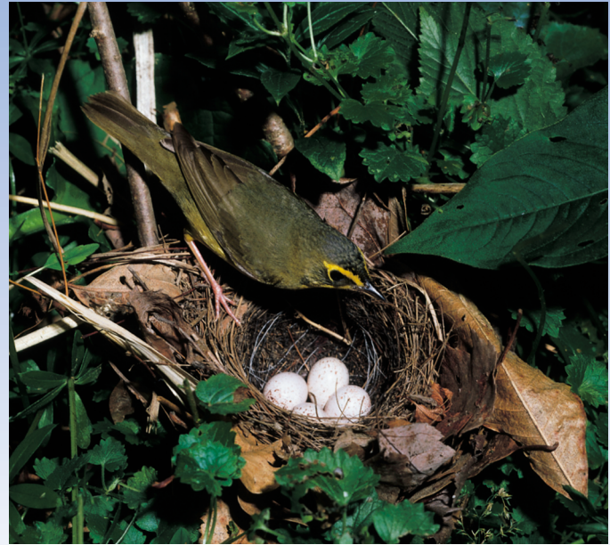
This Kentucky warbler is tending her nest of eggs. A similar species in the tropics would lay fewer eggs. Why?

A second idea, put forward a few years earlier in 1947 by a colleague of Moreau's, David Lack, was more promising. Lack, one of the twentieth-century's great biologists, argued that few if any birds ever produce as many eggs as they might under ideal conditions, for the simple