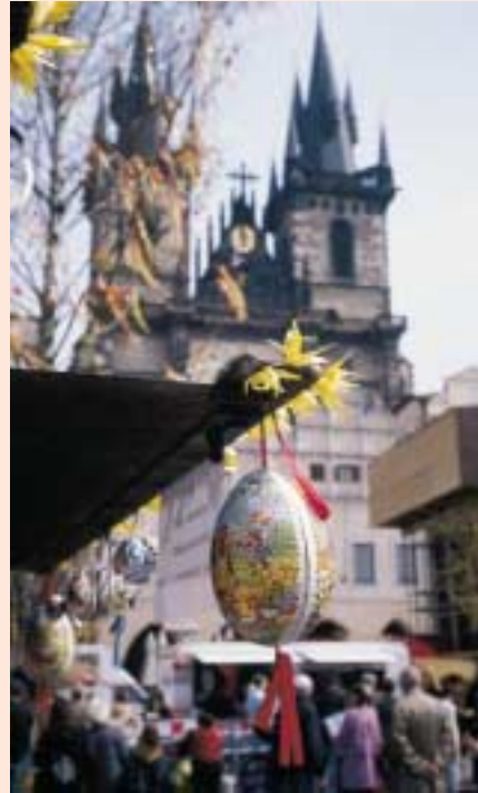
The egg is often used to symbolize the female divine. Here an “Easter egg” hangs in the square fronting Our Lady of Tyn church in Prague, reminding us that at its root Easter is a celebration of fertility.

sentations of the female suggest generation, growth, nurturance, intuition, and wisdom.